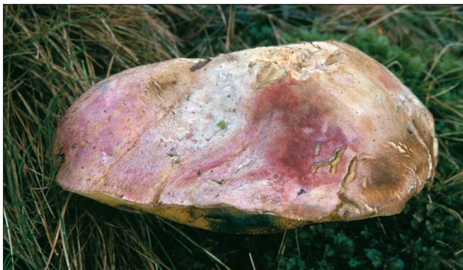
Fig. 3. Boletus kluzakii . Southern Bohemia, NNM Luční, leg. P. Špinar, 17 Sept. 2000 (JŠ 4215). Mature carpophore with a typical, rose-pink to purplish pink coloration of the pileus.