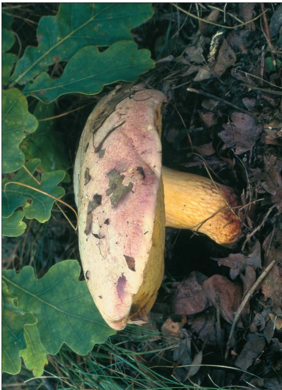
Fig. 2. Boletus kluzakii . Southern Bohemia, NNM Luční, near Sezimovo Ústí, leg. P. Špinar et al., 21 Sept. 1997 (PRM 857093, holotype). Younger carpophore with a light pinkish shade of the pileus.