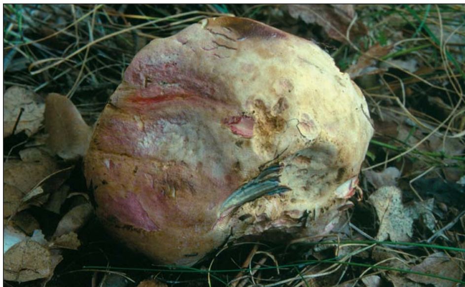
Fig. 4. Boletus kluzakii . Southern Bohemia, NNM Luční, leg. P. Špinar, 15 Sept. 2000 (PŠ 234). Pileus of a younger carpophore. On one place of the pallid pileus surface there is a deep red spot which stained red on bruising. Another place, which was injured more strongly, shows blue oxidation of the context. The red colour of the subcuticular layer of the pileus is distinct in several places where the upper, pallid cuticle was removed from the pileus surface by means of a scalpel.