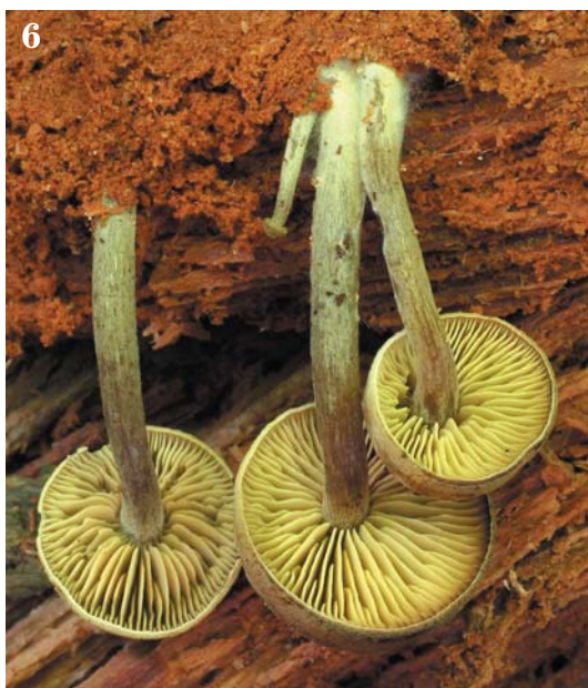
Figs. 3–6. Callistosporium pinicola, finds from the Czech Republic. 3. Moravskoslezské Beskydy Mts., Bílá, Salajka National Nature Reserve, 4. Táborská pahorkatina highland, Dobřejovice, Libochovka Nature Reserve, 5 & 6. Křivoklátsko PLA, Beroun, Roztoky, Stříbrný luh Nature Reserve, For details, see Material studied.