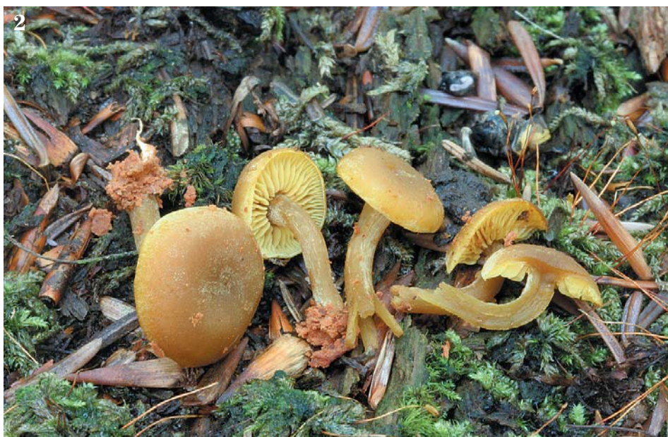
Figs. 1–2. Callistosporium pinicola, finds from the Czech Republic. 1. Šumava Mts., Lenora, Zátoň, Boubínský prales National Nature Reserve, 2. Hostýnské vrchy hills, Rajnochovice, Tesák Nature Reserve, For details, see Material studied.