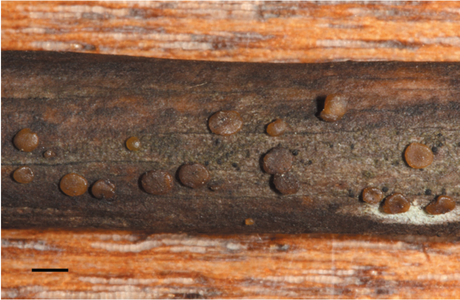
Fig. 1. Basidiocarps of Dacrymyces ovisporus (scale bar 1 mm).