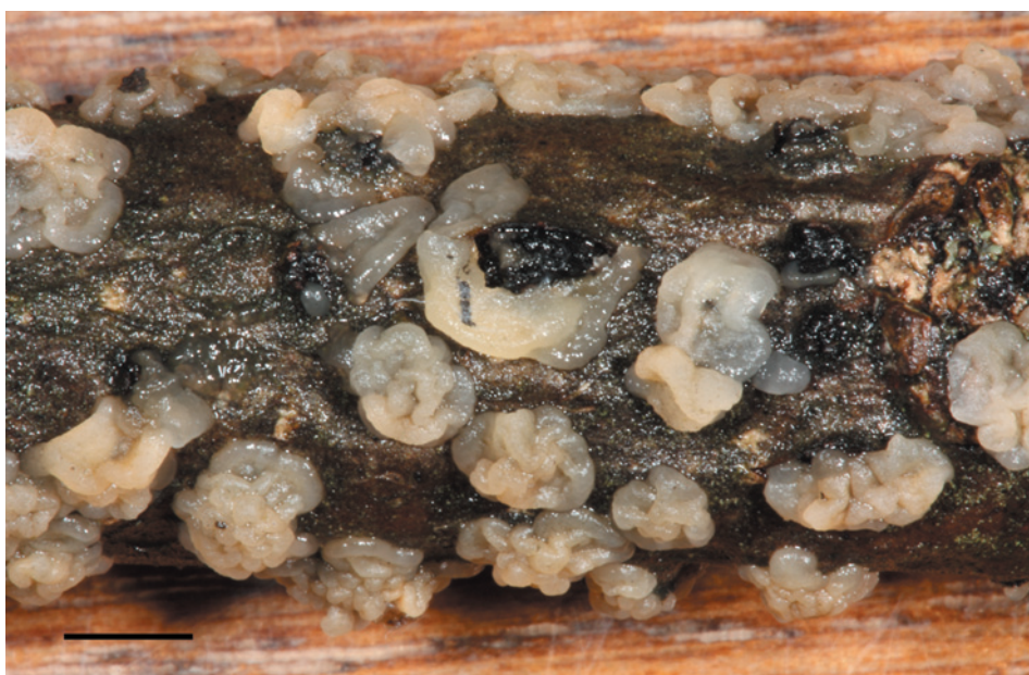
Fig. 3. Basidiocarps of Tremella diaporthicola (scale bar 2 mm).