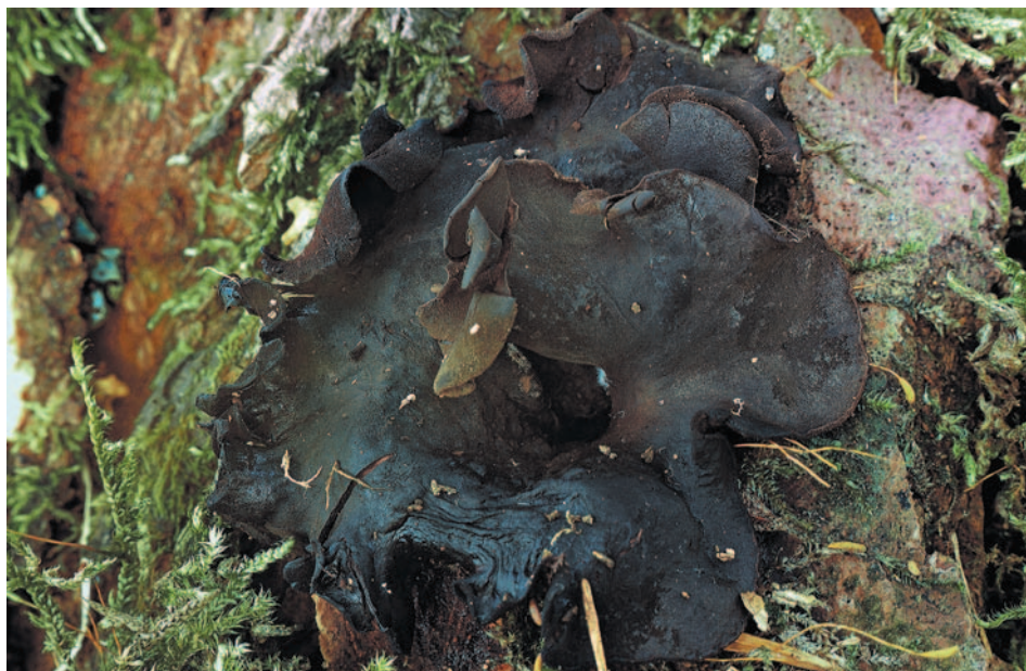
Fig. 2. Old ascomata of Ionomidotis irregularis from Žofinský prales National Nature Reserve (Czech Republic) on decaying beech trunk, 5. X. 2004 (herbarium R. Walley, Gent, no. 3710).