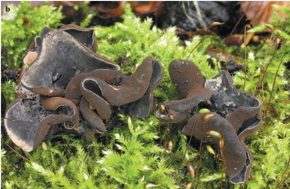
Fig. 1. a – young, sterile ascomata of Ionomidotis irregularis in Holý kopec Nature Reserve, Czech Republic, 27. IX. 2011 (PRM 859942). b – mature apothecia of Ionomidotis irregularis at the same locality, 26. X. 2011 (PRM 859943).