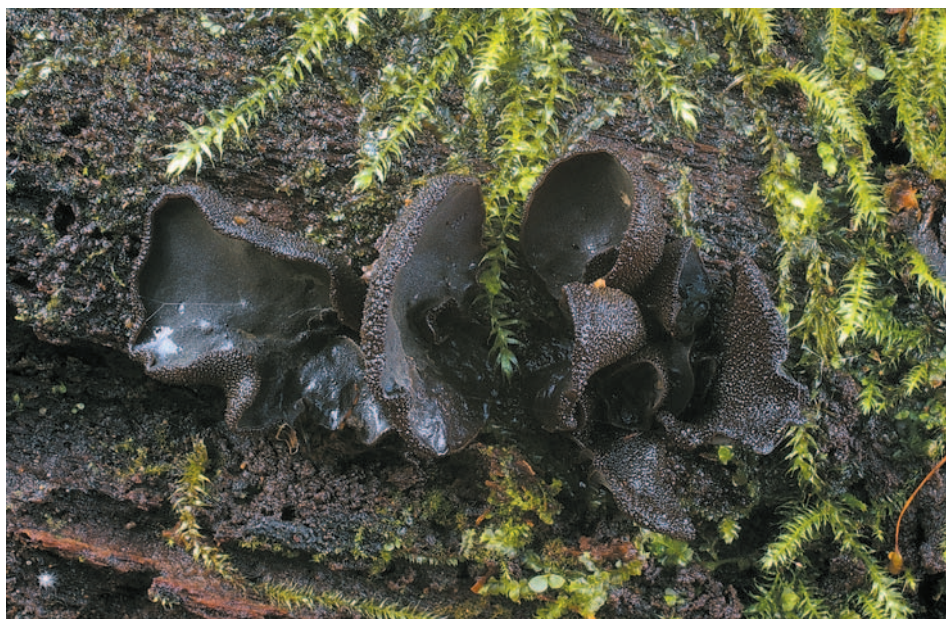
Fig. 3. Mature ascomata of Ionomidotis irregularis from Boubínský prales National Nature Reserve (Czech Republic) on lying decaying beech trunk, 10. IX. 2009 (PRM 899989).