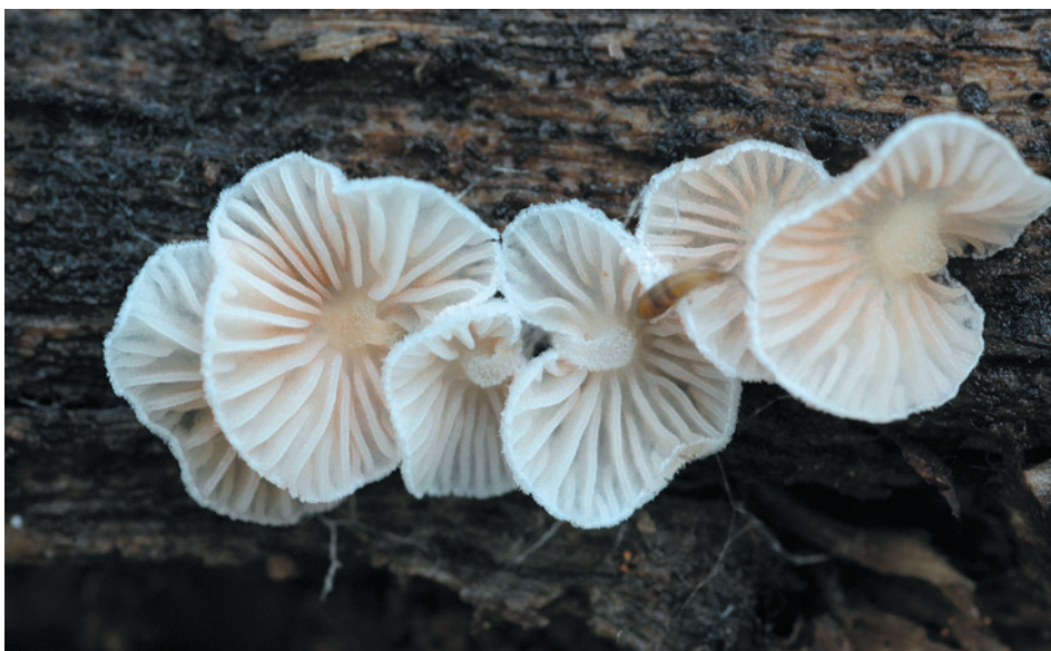
Fig. 1. Entoloma jahni : basidiomata (Slovakia, Štiavnické vrchy Mts., locality called Obyce, 24 July 2008, SLO 1241).