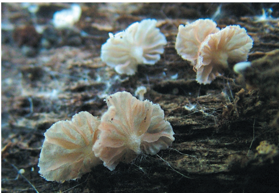
Fig. 2. Entoloma jahni : basidiomata (Slovakia, Vihorlatské vrchy Mts., Vihorlat National Nature Reserve, 27 Sept 2011, SLO 1291).