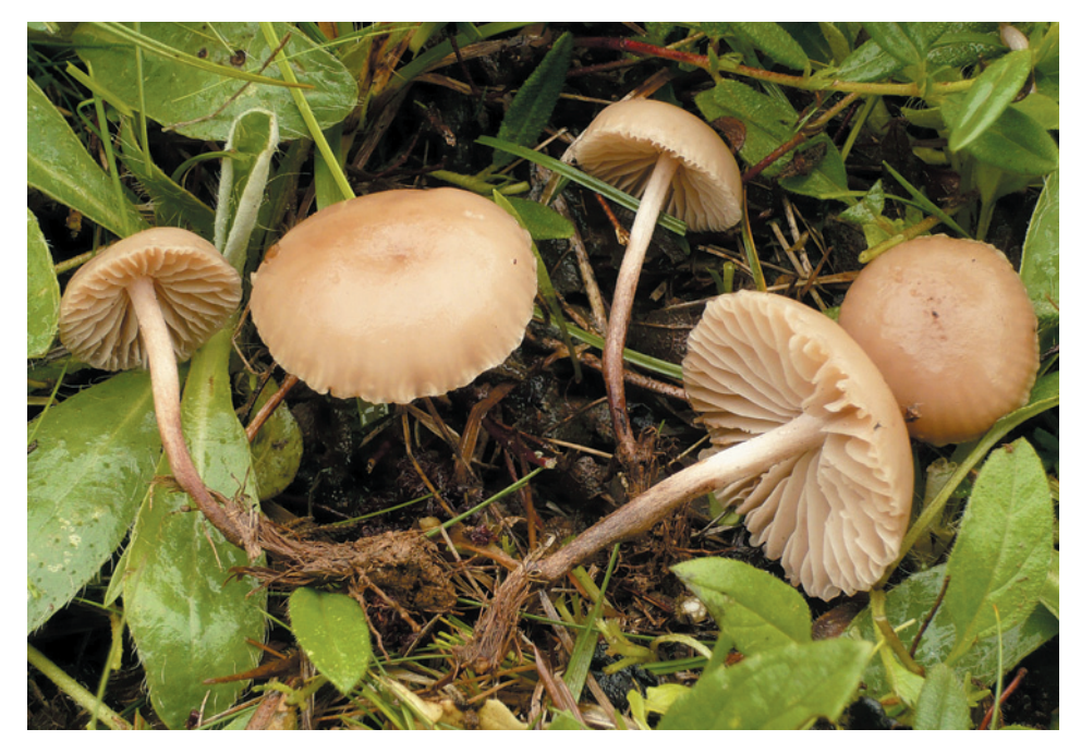
Fig. 1. Basidiomata of Marasmiellus carneopallidus (MCVE 27574) in situ.