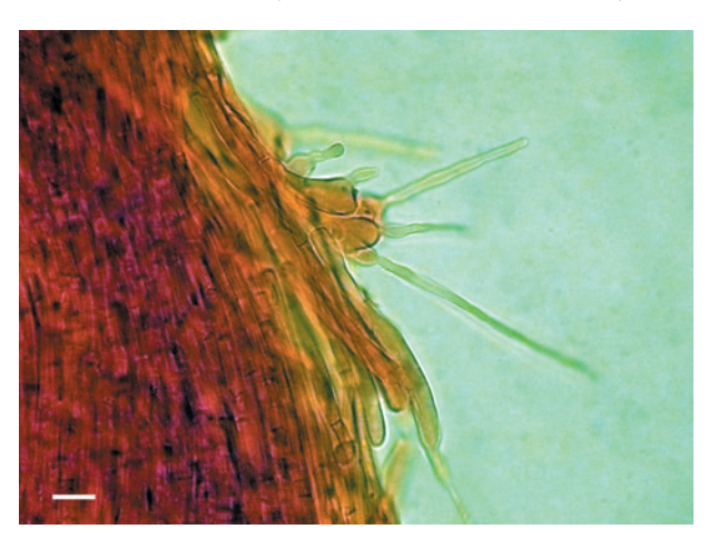
Fig. 4. Caulocystidia of Marasmiellus carneopallidus (MCVE 27574). Scale bar = 10~\mu m .