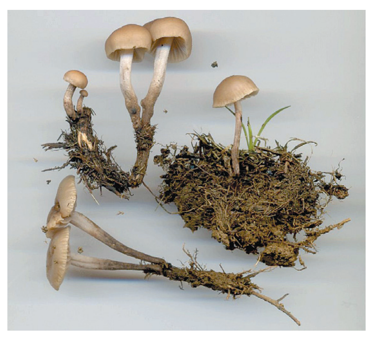
\textbf{Fig. 2.} \ \ \textbf{Basidiomata} \ \ \textbf{of } \textit{Marasmiellus carne opallidus} \ \ (\textbf{MCVE 27574}) \ \textbf{in the laboratory}. \ \ \textbf{Photo: O. Chiarello.}