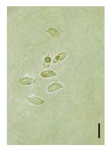
Fig. 3. Basidiospores of Marasmiellus carneopallidus (MCVE 27574). Scale bar = 10~\mu m .