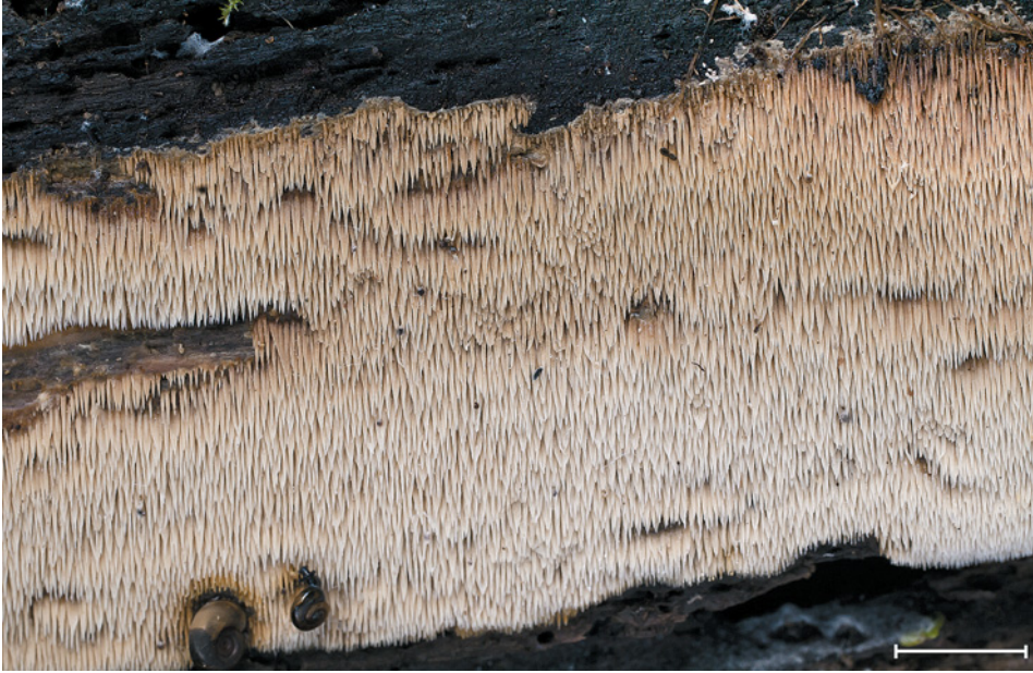
Fig. 3. Fruitbody of Phlebia bispora (HR 103559). Scale bar = approx. 1 cm.