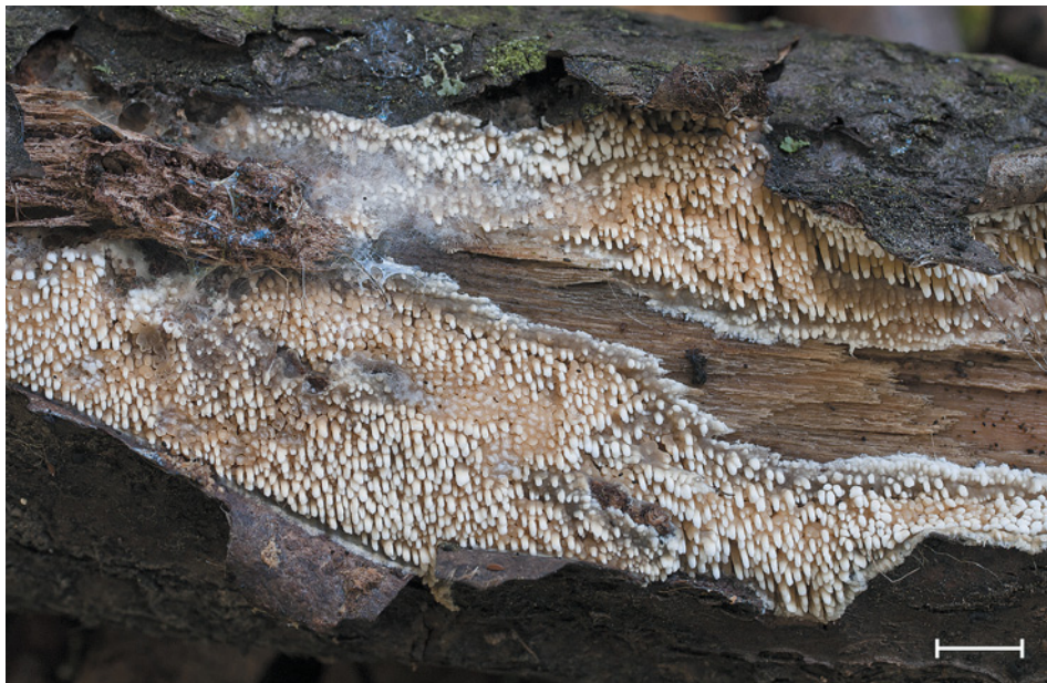
Fig. 1. Fruitbody of Phlebia acanthocystis (HR 103557). Scale bar = approx. 1 cm.